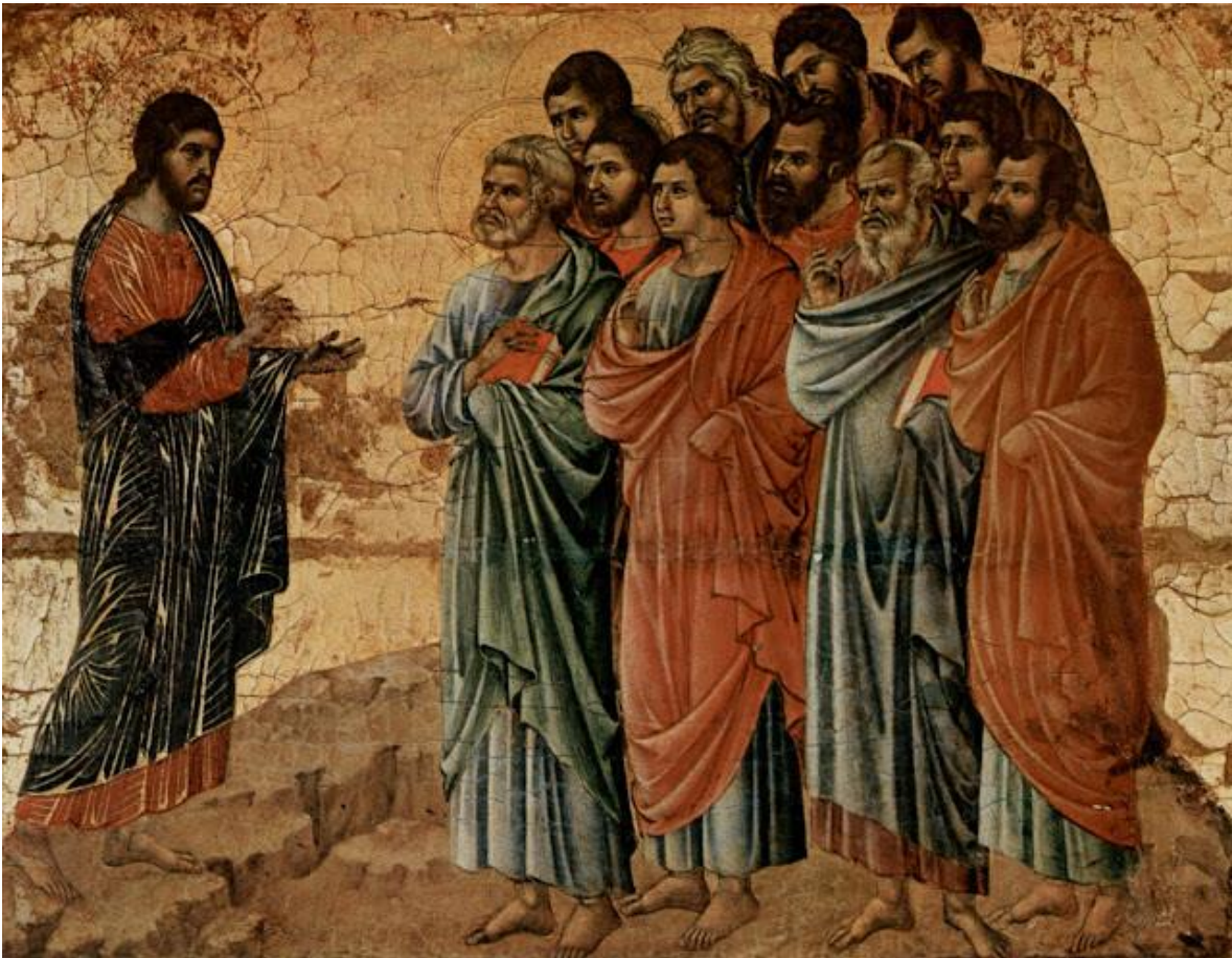
Jesus appears to the disciples, Duccio di Buoninsegna (1260–1318)

May 3, 2026 The Fifth Sunday of Easter Sung Holy Eucharist, 11:00 a.m. with the Cathedral Choir