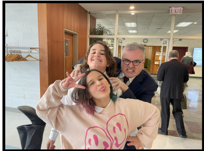
Coffee hour shenanigans