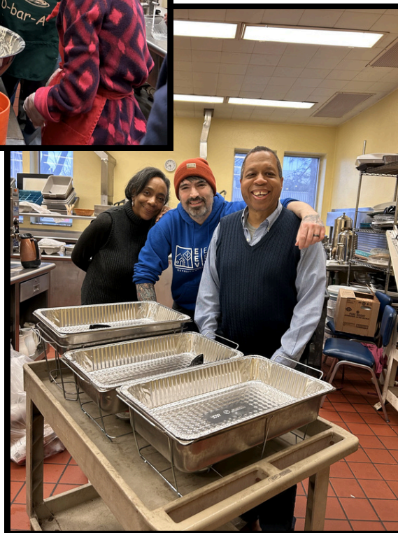
Pancake Supper 2025 volunteers