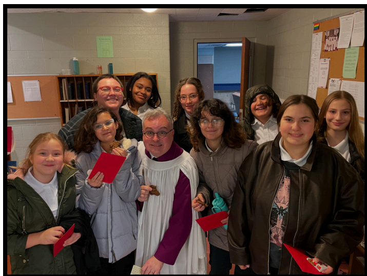
Rehearsing music for evensong