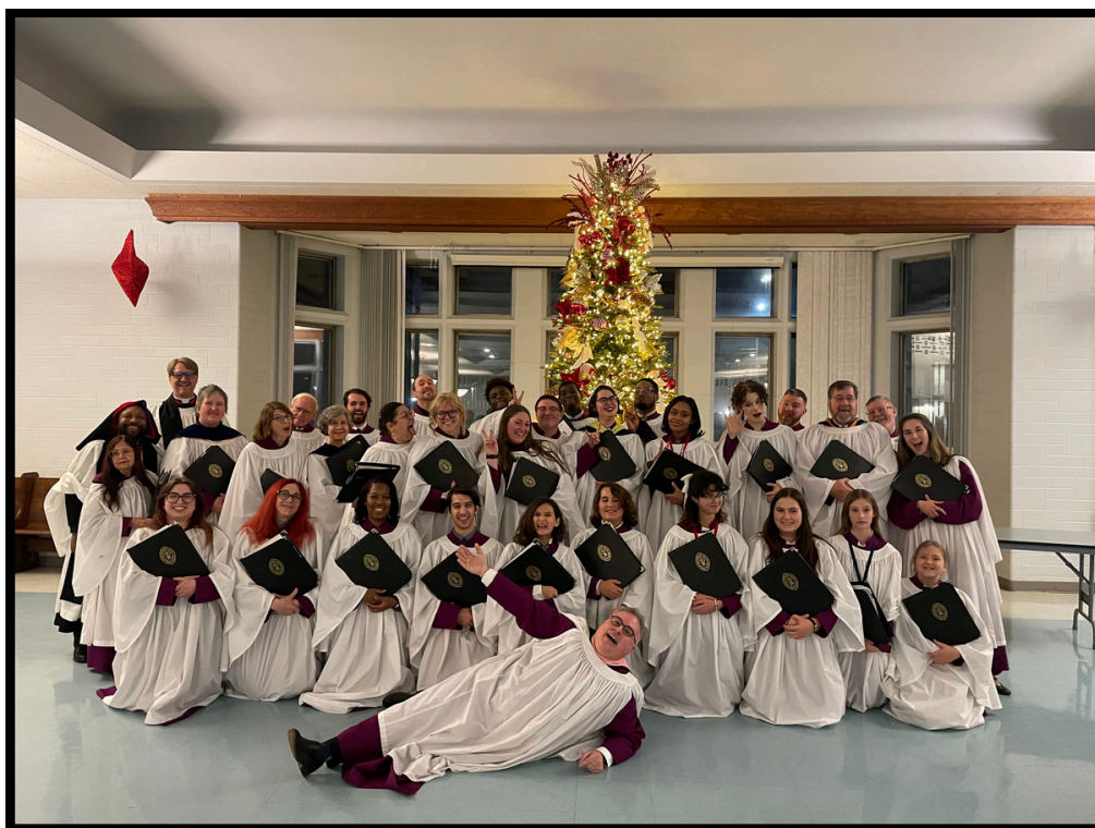
Lessons and Carols 2024